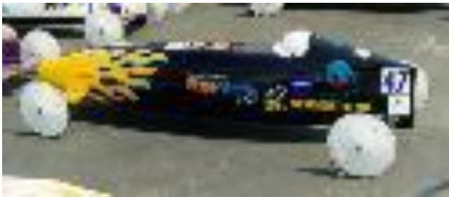
Roll Bar, Rollover Protection