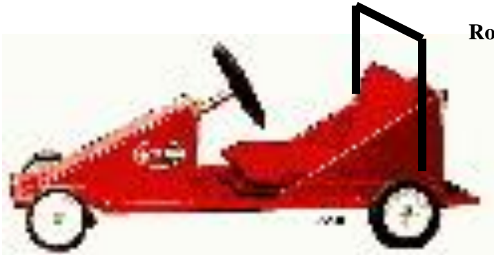
Roll Bar, Rollover Protection